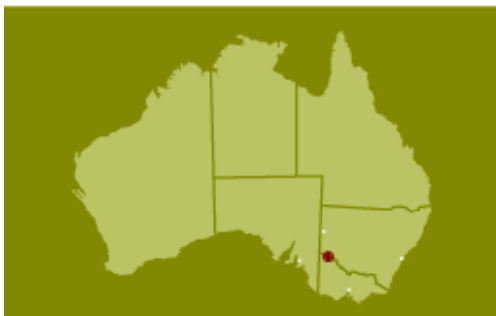
Location of the Winery

An attractive balanced wine with delicate oaking and a fresh clean acidity. Pale straw in colour and has classic peach and melon aromas. The palate displays flavours of tropical fruit combined with the subtle integrated oak.